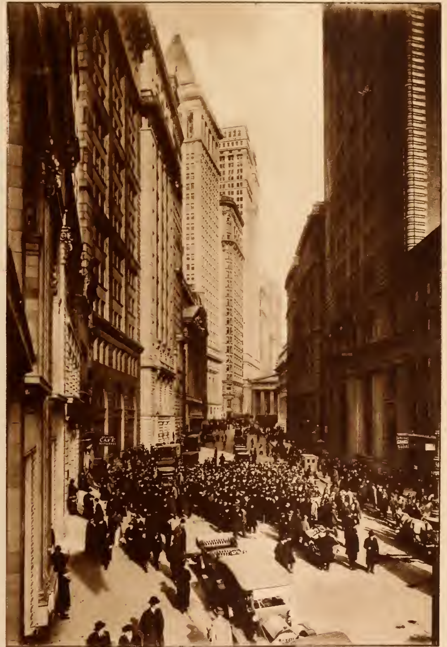
BROAD STREET CURB BROKERS,